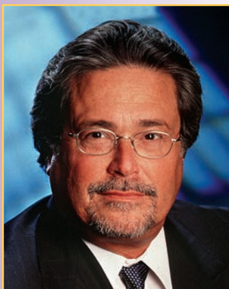
Micky Arison FCCA Chairman, Chairman & CEO, Carnival Corporation

Spend a Wonderful Evening with the Stars!