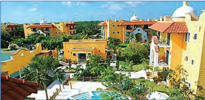
Occidental Grand Cozumel

Please contact the Wyndham Cozumel Resort & Spa and Occidental Grand Cozumel, the official Conference Hotels, directly with any questions you may have regarding your stay and to make your reservations. Be sure to identify yourself as an FCCA Conference participant to guarantee rate. Rates start at US $140. Rates are per room per night and include all meals, drinks, gratuity and taxes.