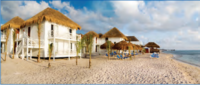
Wyndham Cozumel Resort & Spa - (formerly Reef Club Cozumel)

We are pleased to offer you the following special travel rates. In order to ensure you are able to stay in the hotel of your choice at the lowest rate available and travel on the most convenient flight available, we strongly recommend that you make all travel arrangements as early as possible.